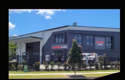
Brisbane - Caboolture