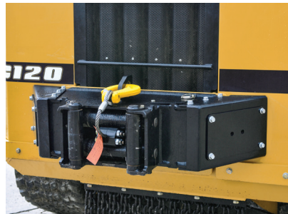
Hydraulic rear winch with 12,000-pound capacity.