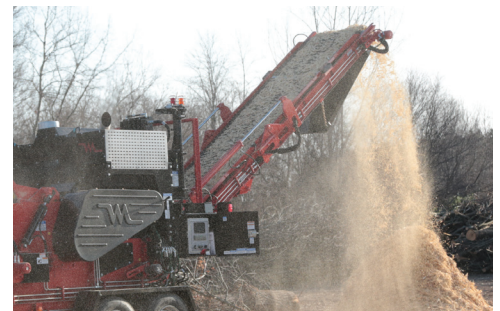
Optional folding conveyor with 14' 6" (4.42 m) discharge height