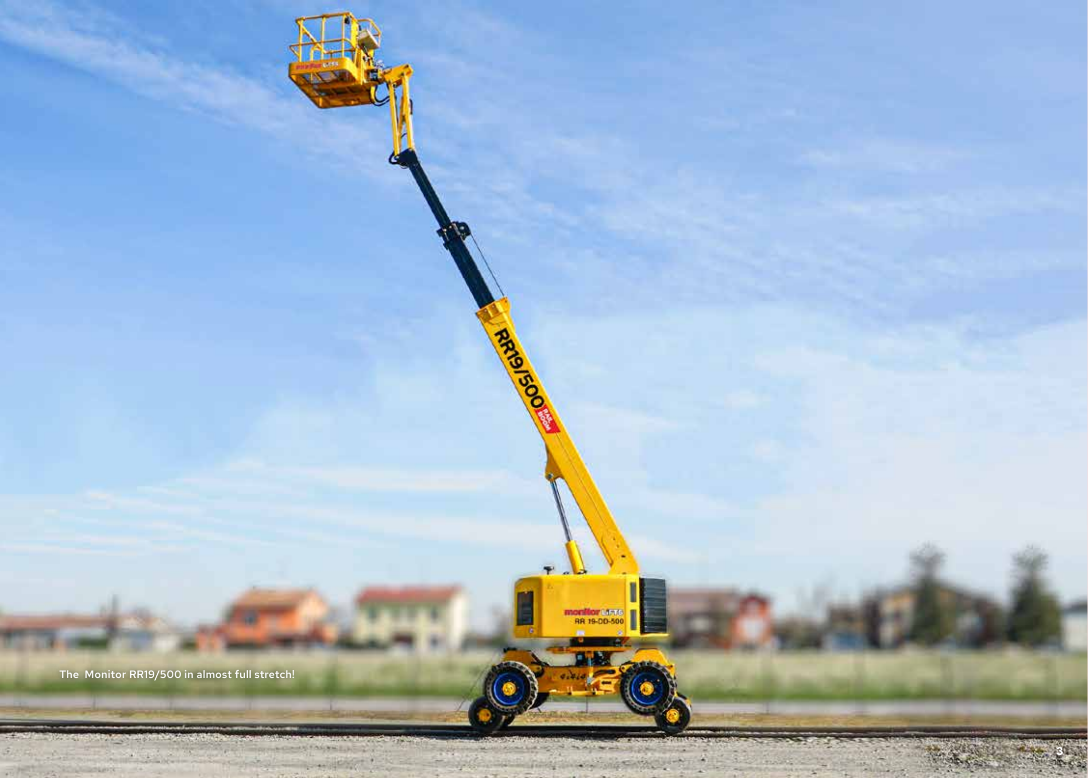
The Monitor RR19/500 in almost full stretch!